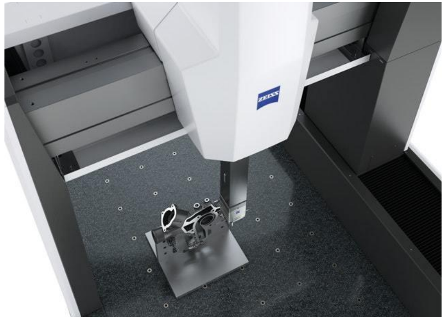
Top: Zeiss's Contura CMM. For more information on Zeiss Contura, email info@elliottmachinery.com Below: The system is controlled via a userfriendly control panel and does not need a computer. The progressive joystick enables easier and more precise control of all axis movements. The speed can be regulated in CNC mode.